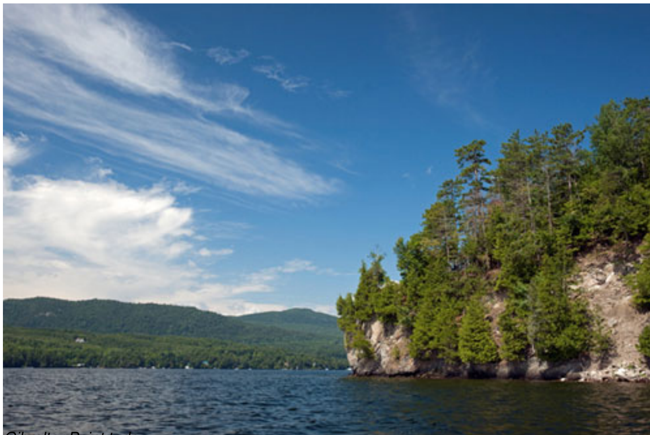
Gibraltar Point today.